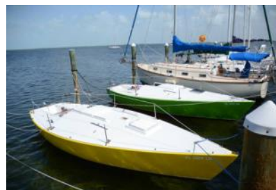
J24's looking forlorn!