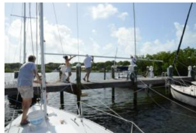
Moving out the masts.