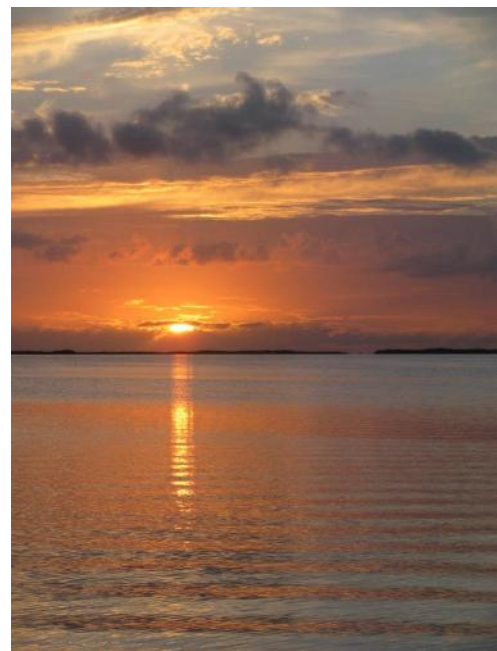
Sunset from the jetty.